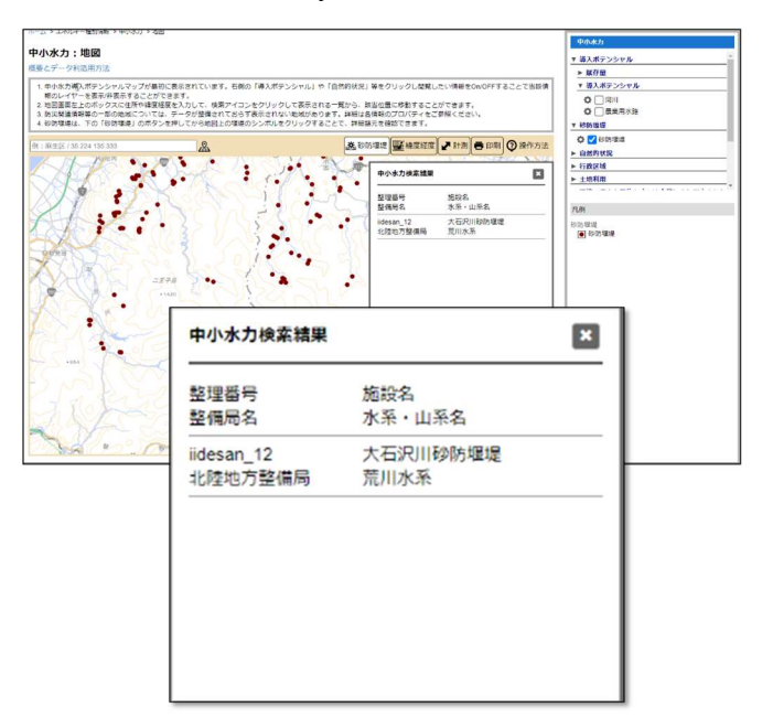
Fig. 2 Results of the superimposition of check dam study data on the REPOS

A suitable mechanism was examined to display data relating to check dams which was collected in the "Entrusted Work to Study Various Factors for the Study on the Potential for Hydropower Generation at Check Dams" conducted by the MoE in FY 2018 and FY 2019 on the REPOS.